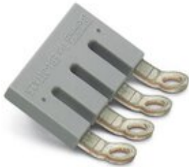
Insertion bridge, pitch: 9 mm, number of positions: 4, color: gray

Please be informed that the data shown in this PDF Document is generated from our Online Catalog. Please find the complete data in the user's documentation. Our General Terms of Use for Downloads are valid ( http://phoenixcontact.com/download )